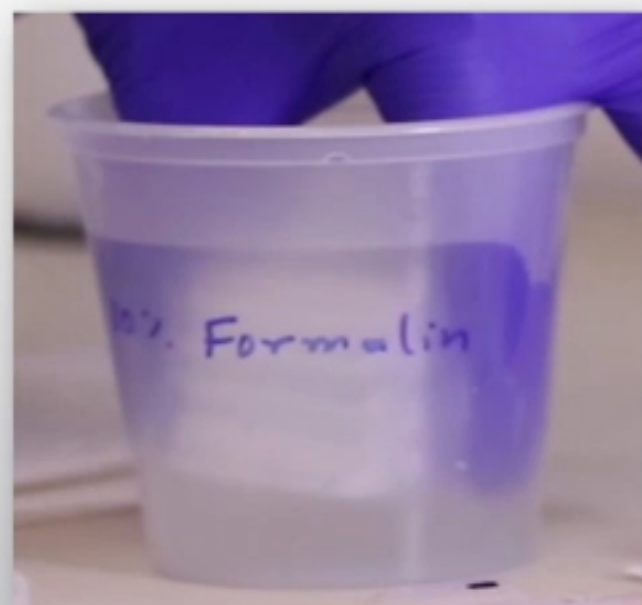
STEP - 5

Let all the cassette fix in horizontal position with bottom down for more than 2 hours. If cross-contamination is anticipated, fix and transport each tissue cassettes individually (instead of stacking and transporting multiple tissue cassettes in one container shown in this demo).