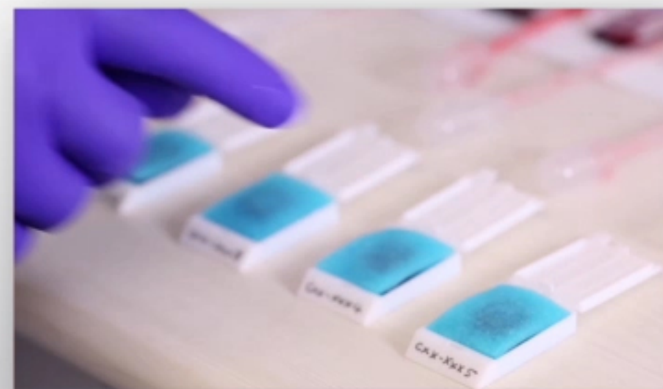
STEP - 4

Put all the sponge discs with concentrated sediments and covered with tissue paper cover between two tissue sponges Into their respective tissue cassettes