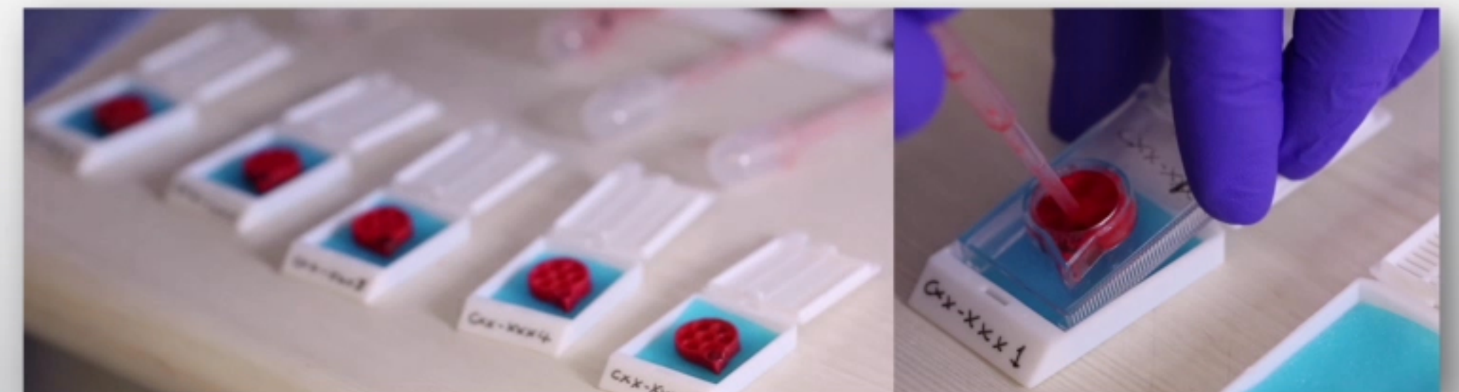
STEP - 3

Transfer the sponge discs with the tip of transfer pipette in to their tissue cassette